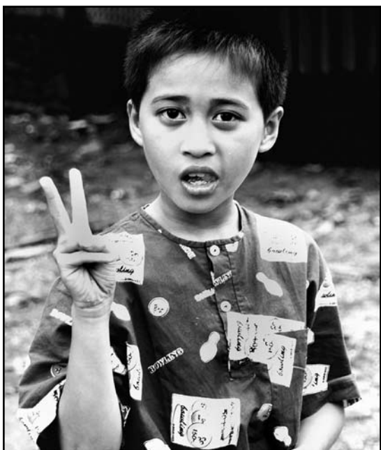
Hope for the future. Outside Rangoon, while adults were busy clearing fallen trees and securing clean drinking water, this boy played with other neighborhood children.

nation's rice, 80 percent of its aquaculture, 50 percent of its poultry, and 40 percent of its pork, according to the Associated Press.