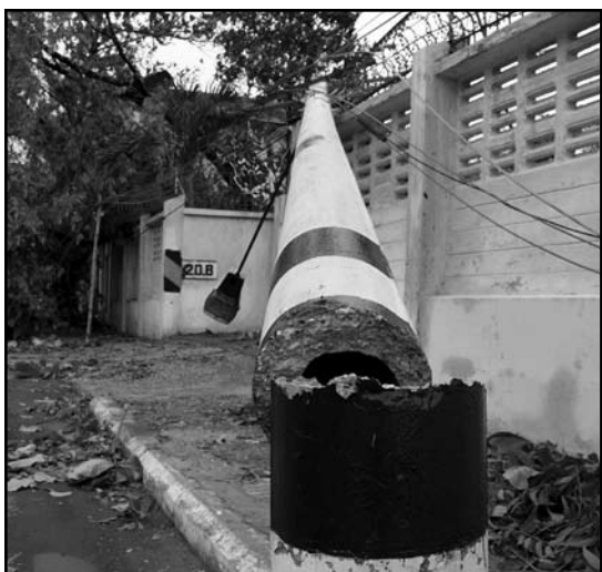
This concrete streetlight was snapped in two pieces close to its base; an indication of the strength of Cyclone Nargis' destruction.