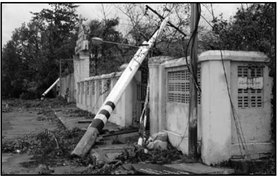
Cyclone Nargis interrupted power for millions of Burma residents and is said to have destroyed significant portions of the country's rice-growing infrastructure. Food and clean water have been hard to come by, thanks in part to the junta's refusal to open their borders to democratic countries they perceive as threats.