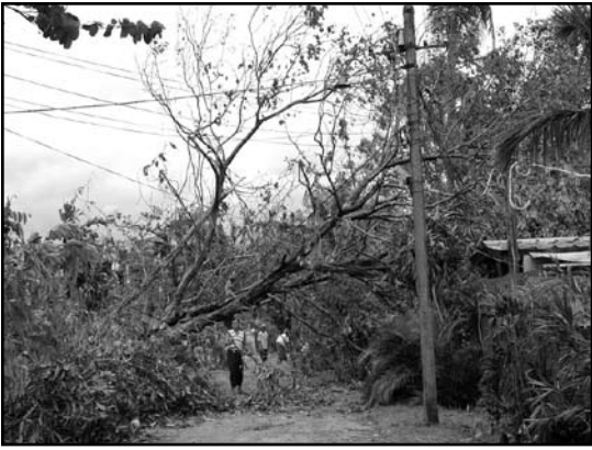
Residents take up the task of removing downed trees from the streets after Cyclone Nargis struck Burma in early May.